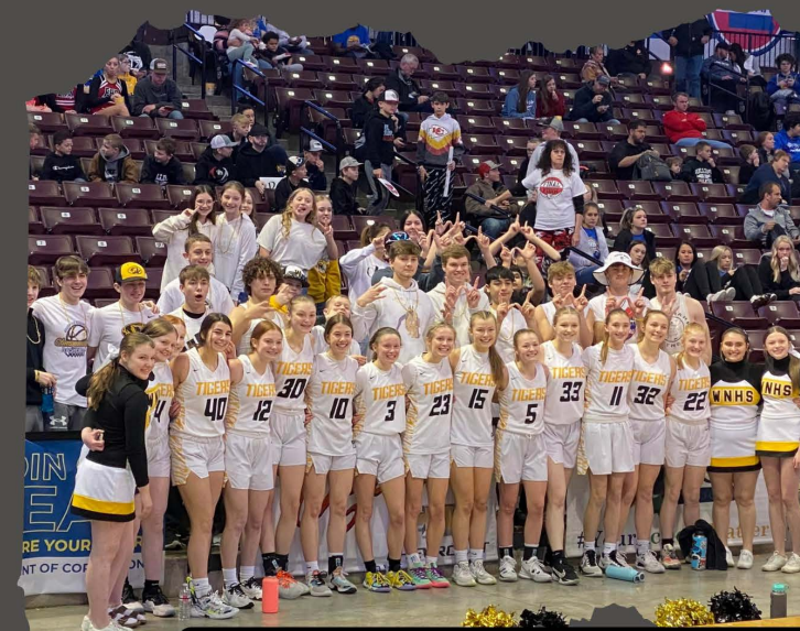
21-22 BASKETBALL STATE CHAMPS

Address: 800 Hwy 131, Wellington, MO 64097 Phone: 816-240-2621 | FAX: 816-857-7030