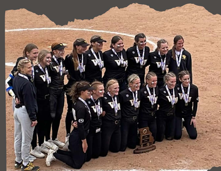
21-22 SOFTBALL STATE CHAMPS